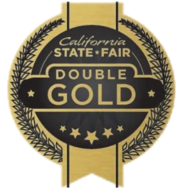
(4.5cm x 5cm)