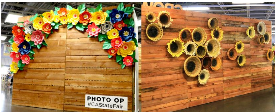
Photo Ops in Building B : This year we combined décor with the popular selfie trend. The photo opportunities ties back with the fair location and theme. Colorful paper flowers and Sunflowers made from old baskets are

Bakery : Every day of the fair, the Upper Crust Baking Company of Davis, CA presented 3 free baking demonstrations and free sampling of bread baked on-site. Baked goods were also available for sale, including the “pig bread on a stick.” Many guests enjoyed freshly baked treats with their wine in the adjacent cool zone. The aroma of baking bread added to the overall experience of the exhibit.